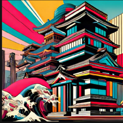
TOKYO STOCK EXCHANGE (4 Mar)