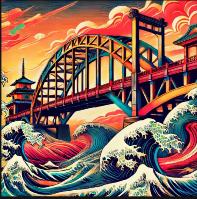
BELLESALLE NIHONBASHI (3 - 4 Mar)