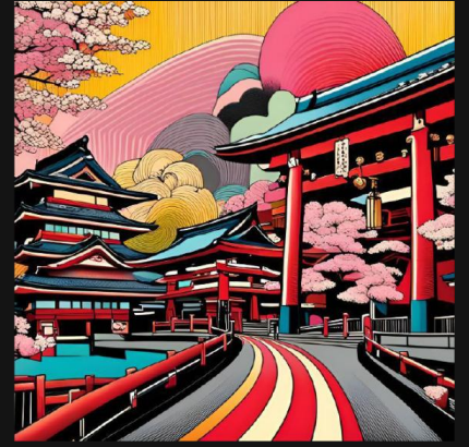
KANDA MYOJIN SHRINE (5 - 6 Mar)